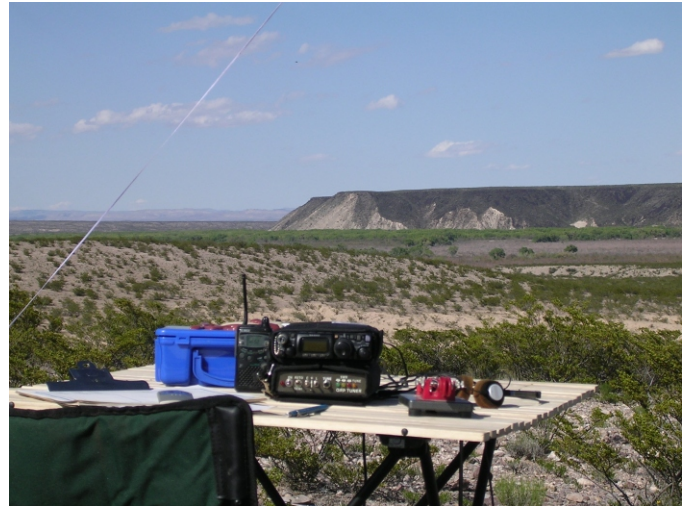
I used my homebrew portable vertical antenna, FT-817, modified Z-11 tuner and an old car battery to work QRPTTF 2004 Battle Stations, 5W.